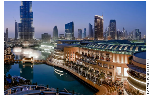
IMAGE: DUBAI MALL