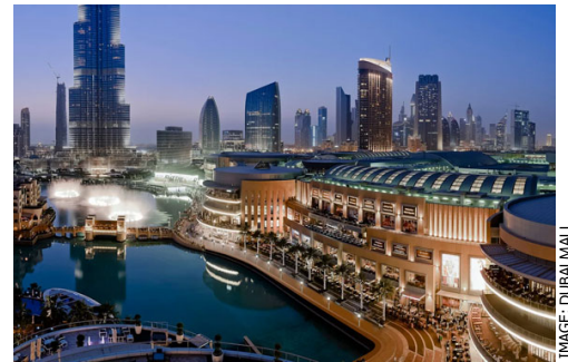
IMAGE: DUBAI MALL