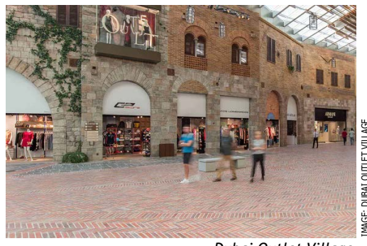
Dubai Outlet Village