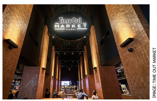
Time Out Market Dubai

Reflection and end of the first tour day