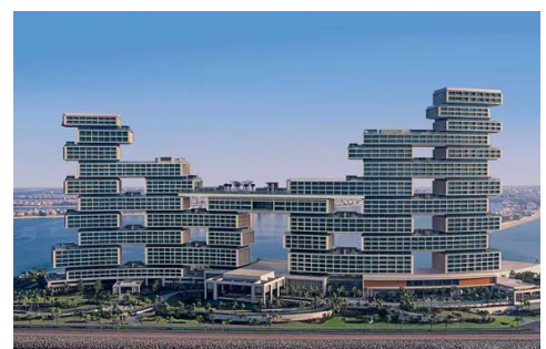
Atlantis - The Royal

*All times and locations are preliminary and subject to change without prior notice. The program will constantly be updated.