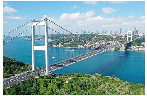
Istanbul - The Traditional Home of Retail