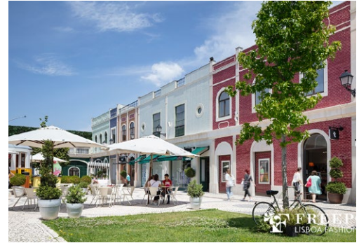
Freeport Outlet Center