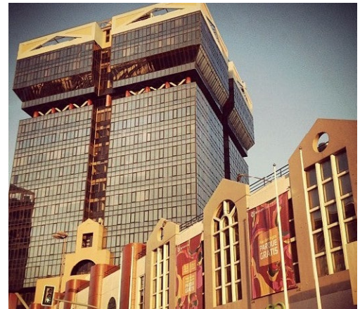
Amoreiras Shopping Center