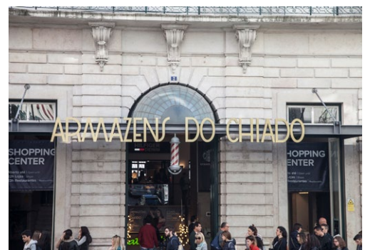
Armazens do Chiado