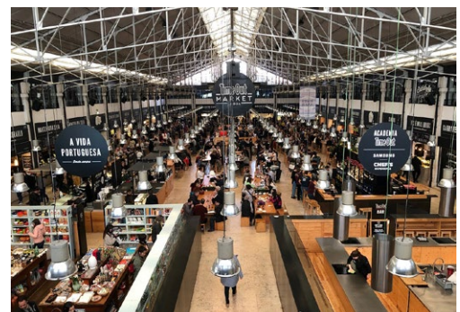
Time Out Market